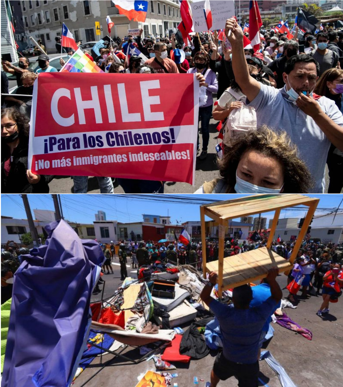
Figure 3: Anti-migrant protests and violence in Chile. Top: sign translates as "Chile for Chileans: No more unwanted immigrants". Bottom: protesters destroying the property of Venezuelan families living in a homeless camp.